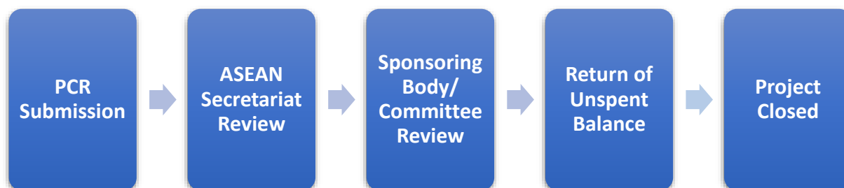
Figure 2: Closing ASEAN Cooperation Projects